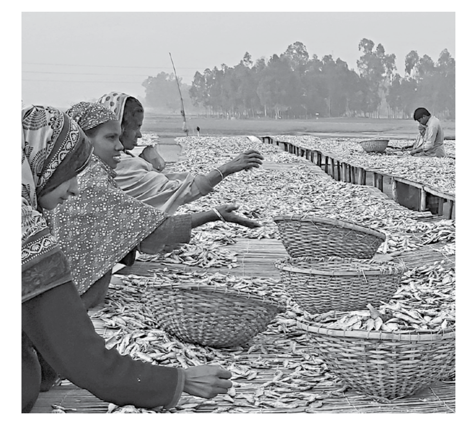
Workers in a recent photo are seen sorting out dried fish at a drying yard in Ningoin shutkipolli area of Natore's Singra upazila.