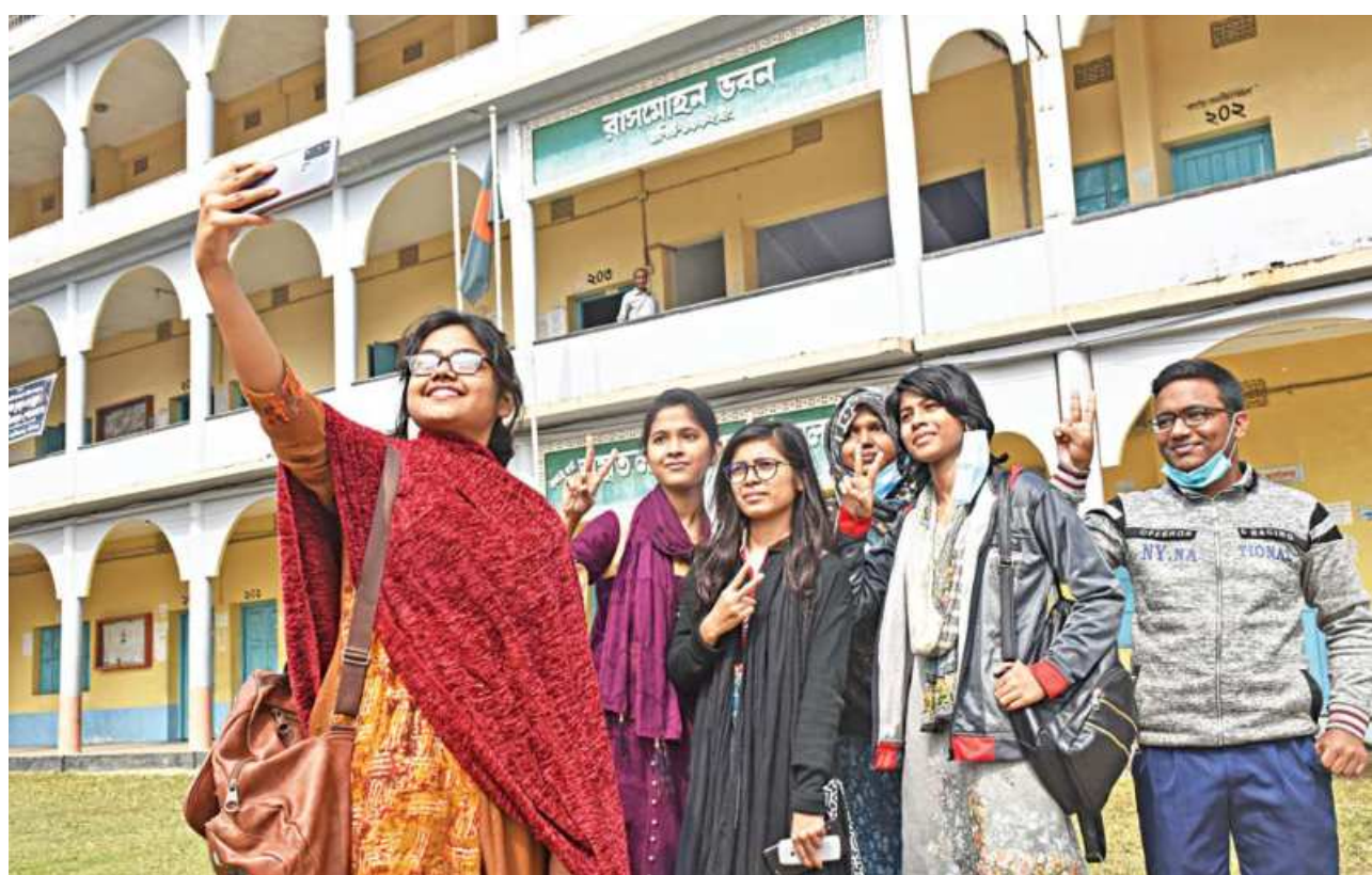
Gatherings at educational institutions have virtually gone extinct due to pandemic-induced restrictions. The age-old tradition of uniting at college premises after HSC results is also gone. Some students still tried to recapture the magic by getting together at Barishal's Amrita Lal Dey College yesterday following the publication of auto pass results online.

Police suspect Anwar was murdered following dispute over salary and for money.