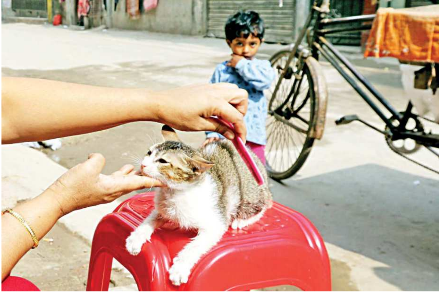
A woman puts a plastic stool out in the sun so her pet can dry off as she is groomed with a fine-toothed comb. Cats hate getting wet, but it may be necessary, especially for the more boisterous and outdoorsy ones, to be given a shower once in a while. The photo was taken recently from the capital's Tajmahal Road area.