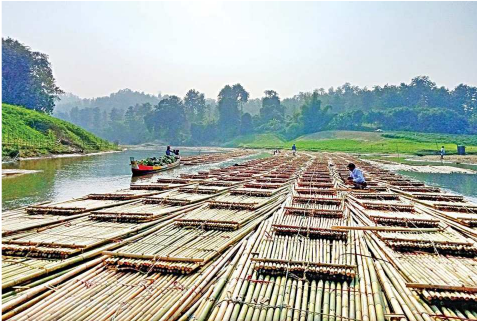
Bamboos stolen from a reserved forest in Alikadam, Bandarban, are being rafted to nearby towns using the Matamuhuri river in broad daylight. Thanks to nonchalant authorities, people involved in the illicit trade do not think twice about harming reserved forests. The photo was taken recently.