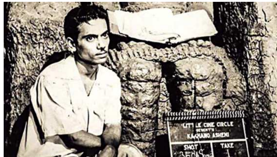
Zahir Raihan on the set of the film Kokhono Asheni (1961).