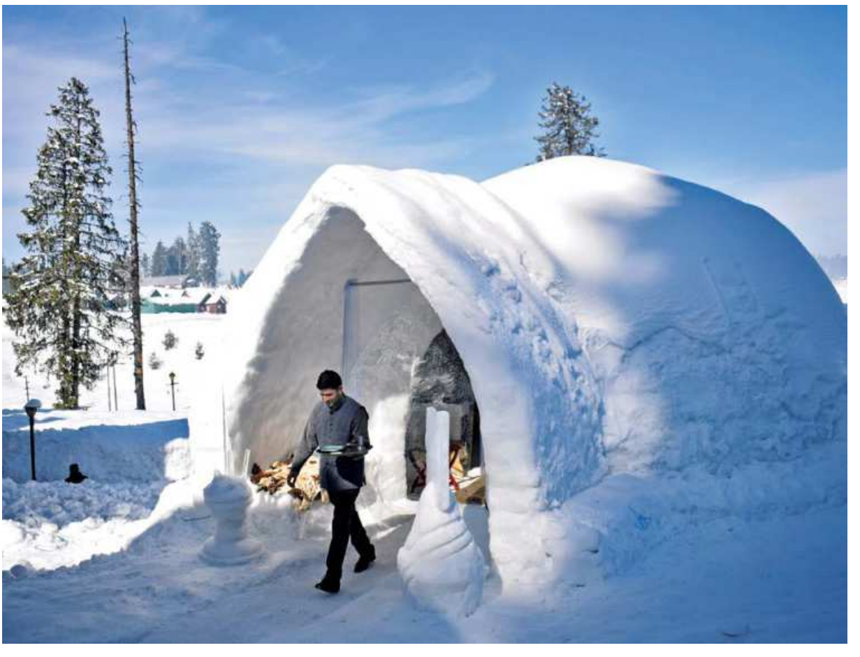
A waiter comes out of "Igloo Cafe", a cafe prepared with snow and ice, after serving customers at Gulmarg, a ski resort and one of the main tourist attractions in Kashmir region, India yesterday.