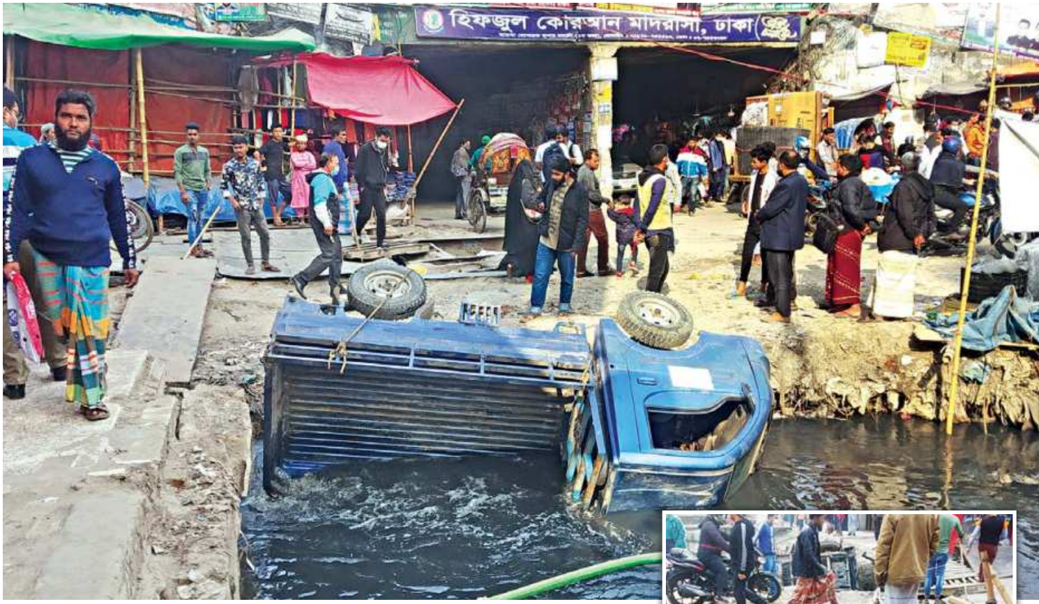
A blue pick-up truck lies overturned in the drain at a service road passing under Dhaka-Chattogram highway. Commuters on foot glance at the truck and move on -- after all, this is a regular occurrence for the last couple of years at this road in Shonir Akhra. Vehicles are forced to use this unsafe road riddled with bumps and holes, inset, as there is no U-turn for about four kilometres from Jatrabari towards Signboard area in Narayanganj.