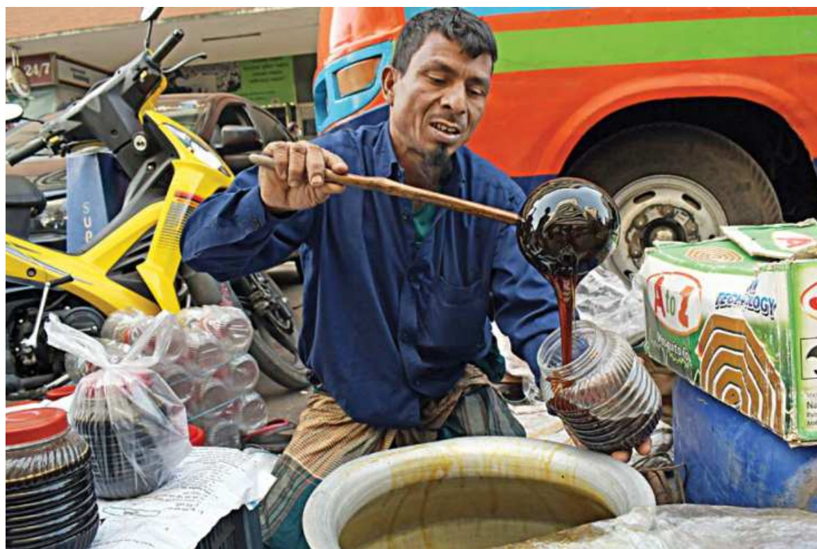
Filling up a jar with the sweetener, a molasses seller readies his product for prospective customers at the capital's Karwan Bazar. The seller sources the molasses all the way from Joydebpur and sells it in the city for Tk 220 per kg. He takes home Tk 800-1,000 in profits, after selling around 40 kg per day.