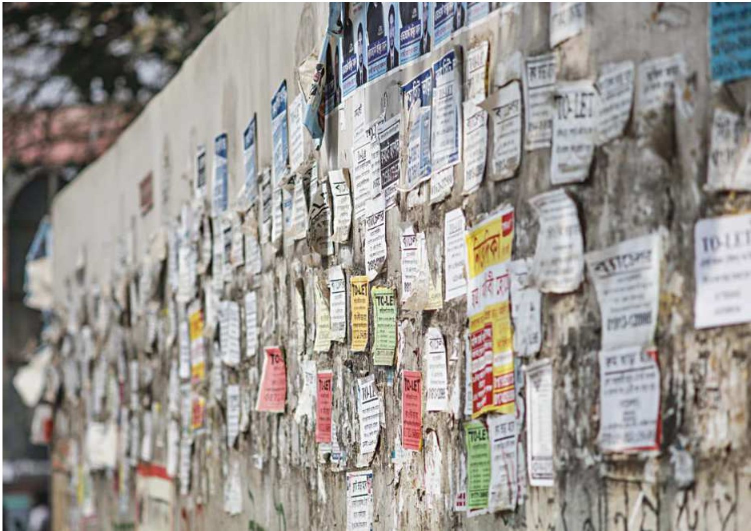
Defying a ban imposed by the authorities, people have been putting up posters and fliers on the wall of Holy Cross College, making it displeasing to the eyes, in the capital's Farmgate area.