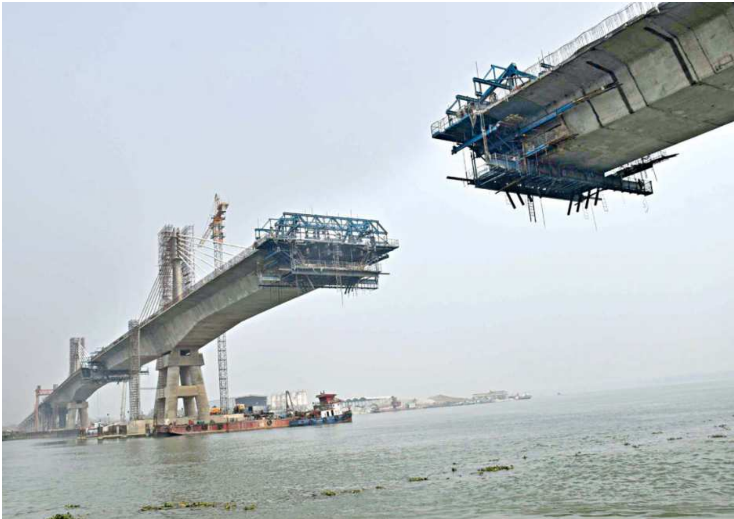
ONLY YARDS TO GO ... The Payra Bridge in Lebukhali area of Patuakhali on the Dhaka-Kuakata highway is almost finished. Once completed, trips to the tourist destination from the capital will be a lot easier. The photo was taken recently.