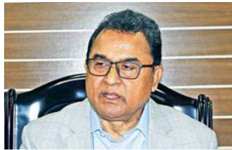
AHM Mustafa Kamal

statistics on the current poverty rate, he replied: "It will be known once Bangladesh Bureau of Statistics conducts a survey on it." According to government estimates, the poverty rate was 20.4 per cent in December 2019.