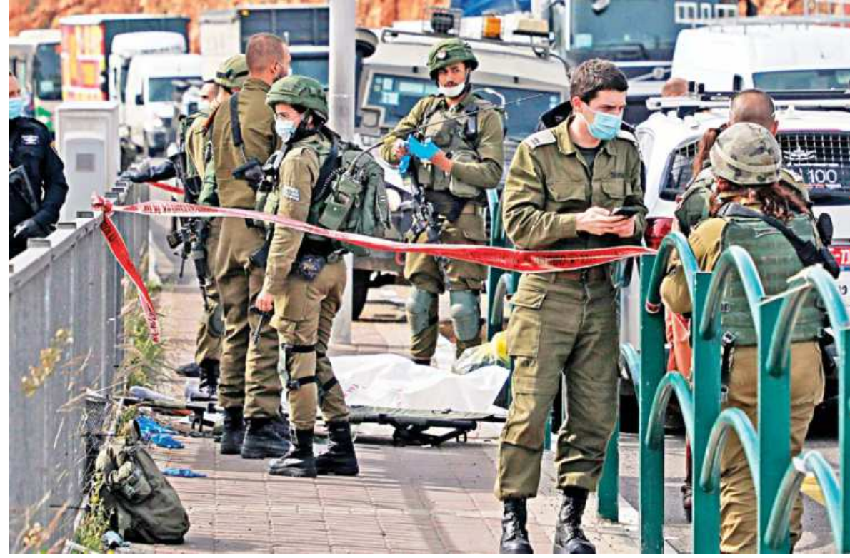
Israeli soldiers gather by the body of a Palestinian man who was shot dead reportedly while attempting a knife attack at the Gital Avisar Junction, west of the Jewish settlement of Ariel and south of Nablus in the occupied West Bank yesterday.

(Our correspondents from Lalmonirhat, Thakurgaon and Manikganj contributed to the report.)