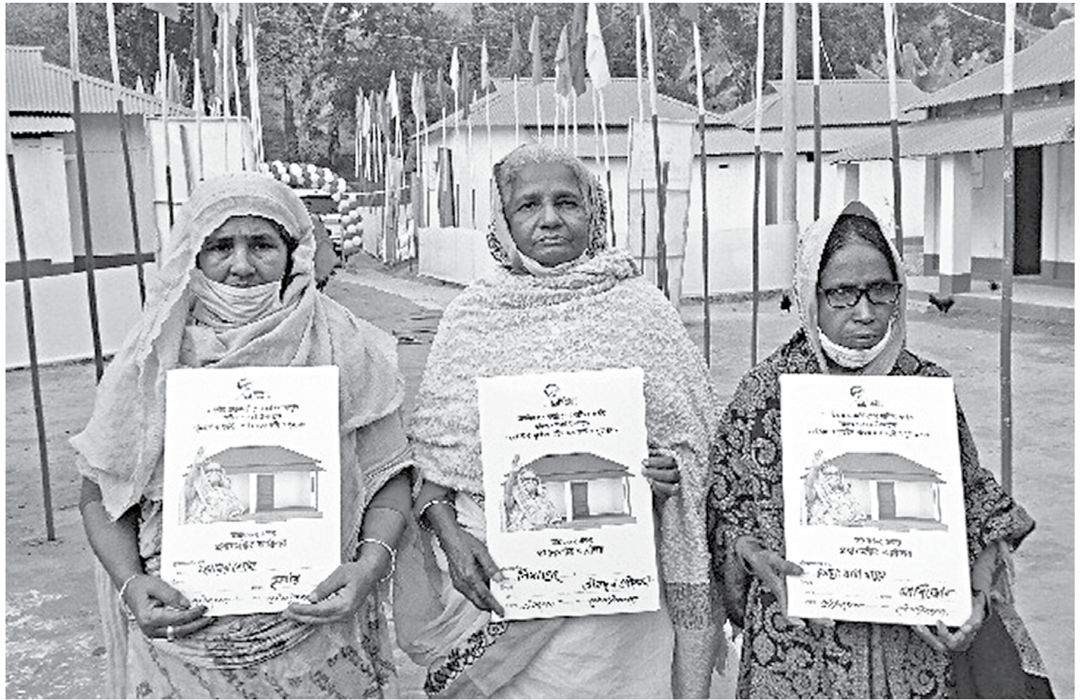
Three Birangonas in Moulvibazar's Sreemangal upazila get new houses on the occasion of Mujib Year.

"We have already handed over 100 houses to the homeless families. The rest of the work is going on. Construction work of the houses will be finished soon," said the UNO.