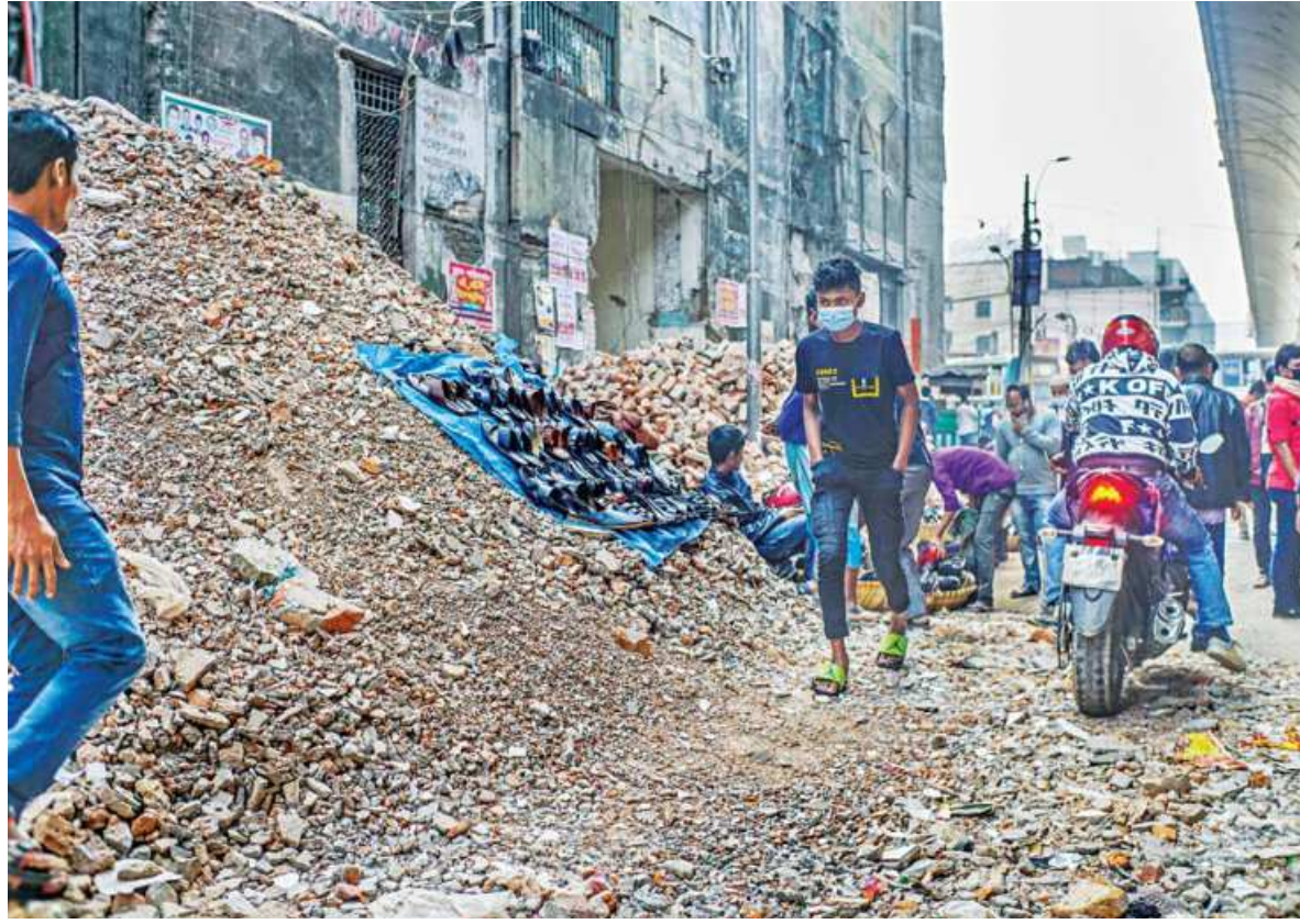
Concrete debris remain piled up on the road since Dhaka South City Corporation demolished evicted illegal shops at Gulistan's Sundarban Square Market last month. Commuters, pedestrians and even street hawkers seem to have just accepted the obstacle, making their way through the heap as the road has become almost entirely overtaken. The photo was taken yesterday.