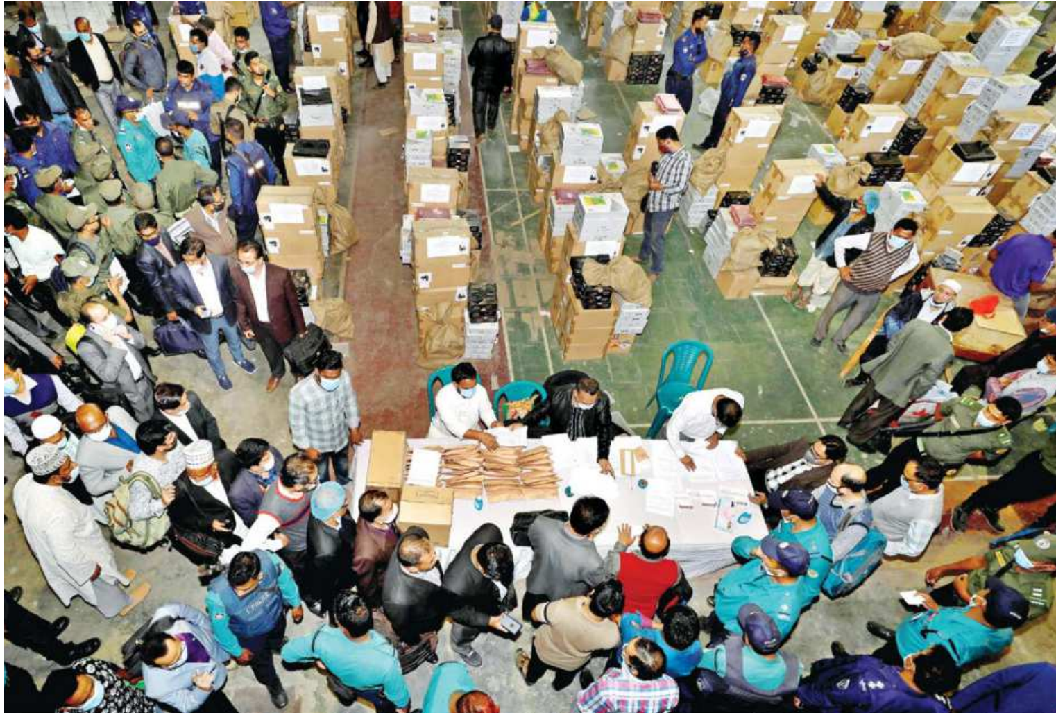
Officials distribute polling materials among election officers at the gymnasium hall of MA Aziz Stadium in Chattogram city yesterday. The polls to Chattogram City Corporation are being held today amid tight security. Seven mayoral and 229 councillor candidates are contesting the elections in 41 wards.