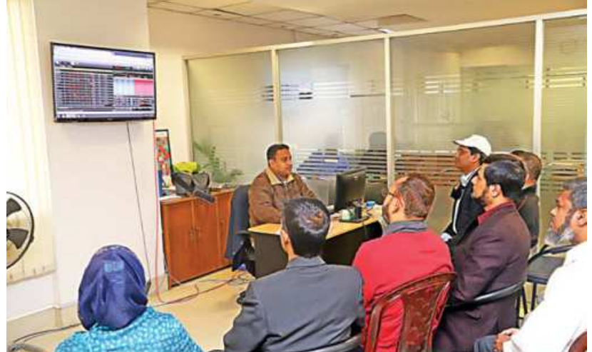
People watch price fluctuations of stocks on a television screen at a brokerage house in Dhaka yesterday.