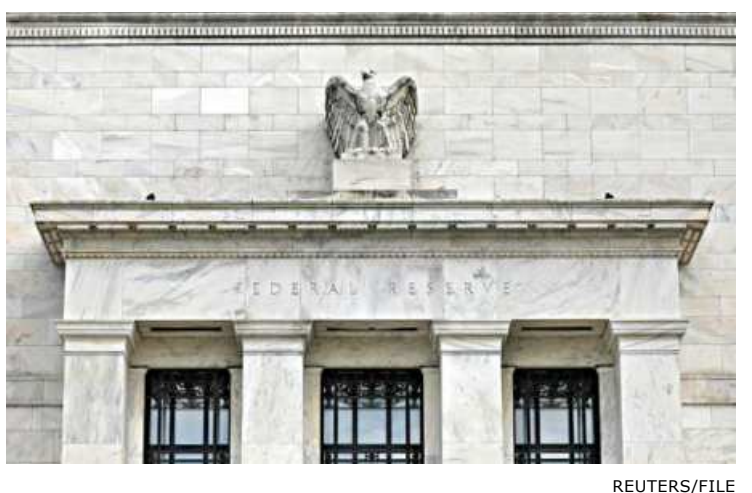
The Federal Reserve building is pictured in Washington.

Business shutdowns imposed to contain the spread of the virus caused immediate, massive job losses in 2020, and at the end of But the historic nature of the the year, four million people had job losses during the pandemic -- been unemployed for six months more than 10 million US workers or more, comprising 37 percent remain unemployed -- coupled of total unemployment. The