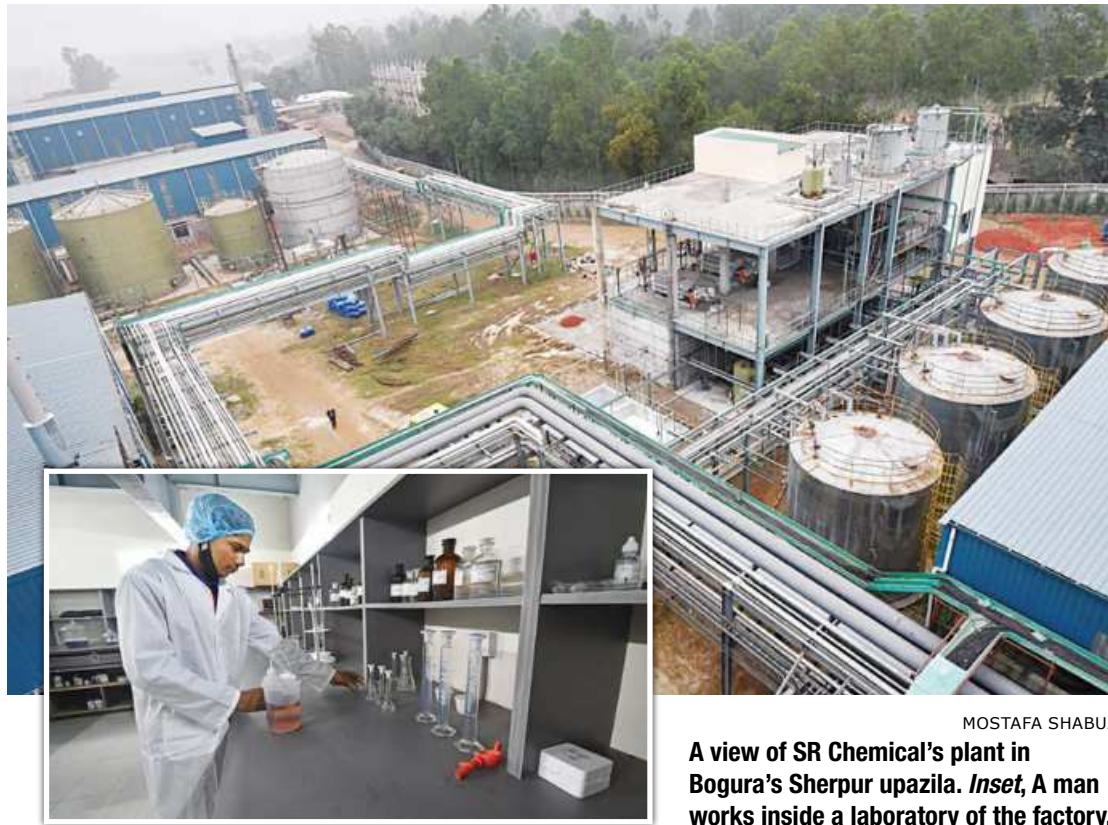
A view of SR Chemical's plant in Bogura's Sherpur upazila. Inset, A man works inside a laboratory of the factory.