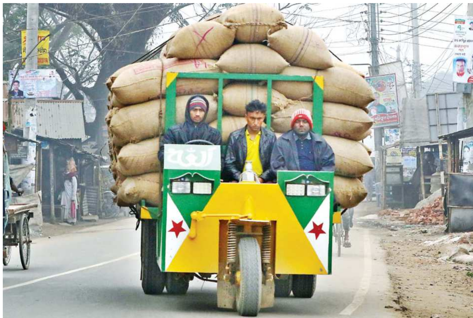
A three-wheeler, overloaded with sacks of rice, on Dhaka-Kishoreganj highway in Bajitpur, Kishoreganj. The authorities have been struggling for years to keep these vehicles off the highways. Transport associations say that these three-wheelers are one of the major causes of frequent crashes.