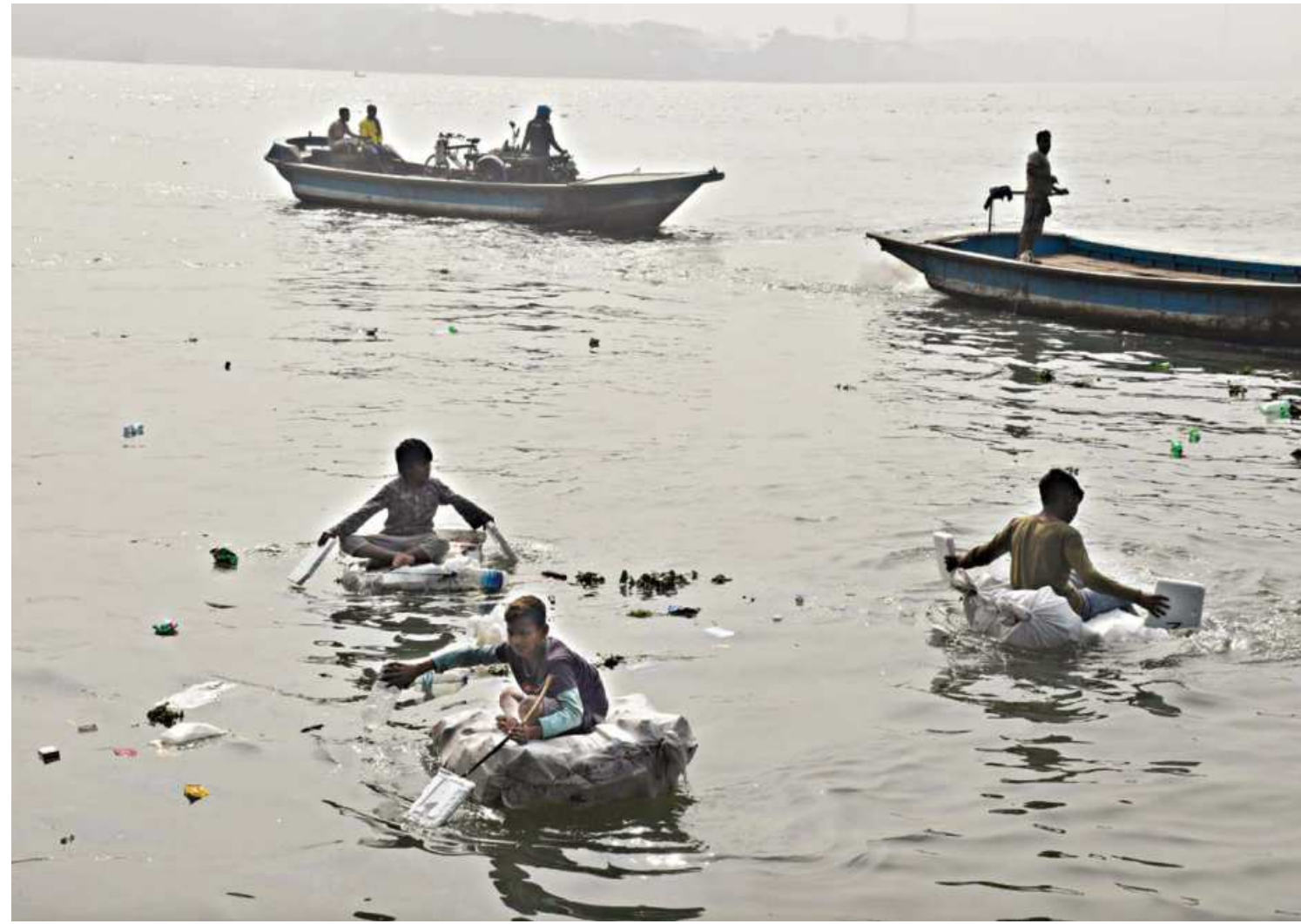
Children collecting empty water bottles, mostly thrown away by the passengers of Dhaka-bound launches, from the Kirtankhola in Barishal. The photo was taken yesterday.