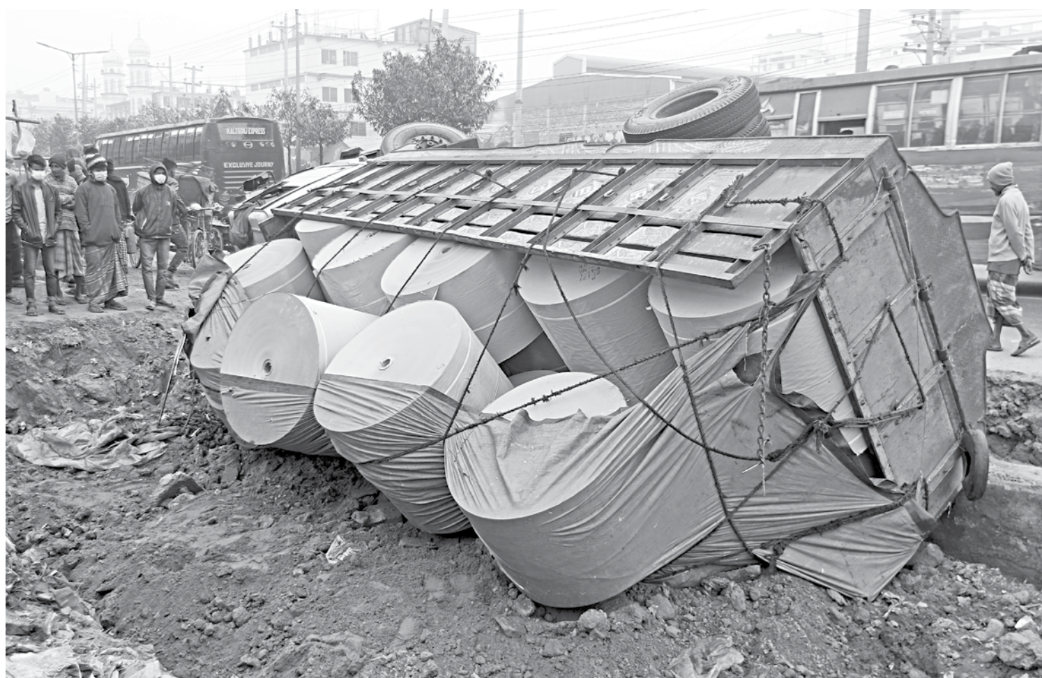
The paper-laden truck lost control and turned over by the road near Dhaka-Aricha Highway's Savar bus stand area. With a cold wave sweeping over the country, visibility can be low on roads especially during the early hours of the day, and demands extra caution from drivers of heavy vehicles to avoid such accidents.

Aside from leadership training, students also worked in small groups to apply their lessons in social service projects. They designed and implemented small but realistic, measurable, and results-driven projects to serve impoverished communities, the press release said.