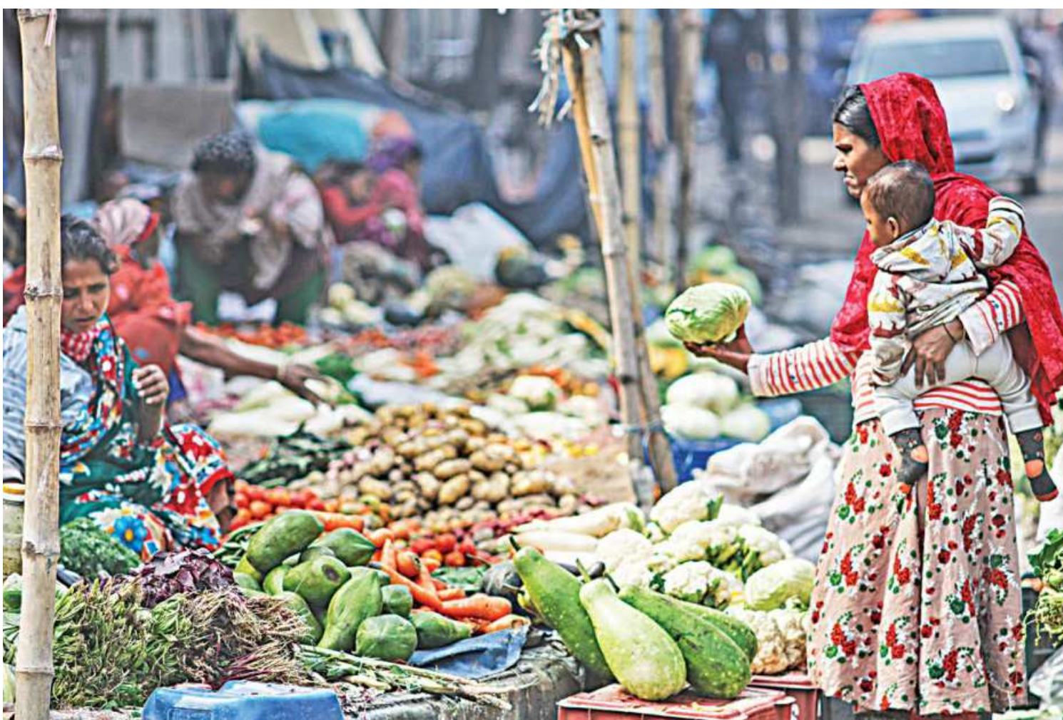
To get a solid deal, a woman was seen haggling for a cabbage at a bazaar in the capital's Tejgaon area yesterday. As vegetable prices have significantly dropped in the past weeks, people of lower income group can finally enjoy the fresh produce winter brought with it.