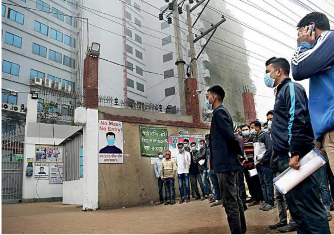
Laid off in the pandemic-induced economic downturn, garment workers wait patiently outside a factory in Ulail, Savar yesterday in hopes of work, refusing to be put off by a sign that reads "No Vacancies! Appointment Activities Suspended!"

The outcome of the study was presented during the dialogue on "Vulnerability, Resilience and Recovery in the RMG Sector in view of Covid-19 Pandemic: Findings from the Enterprise Survey".