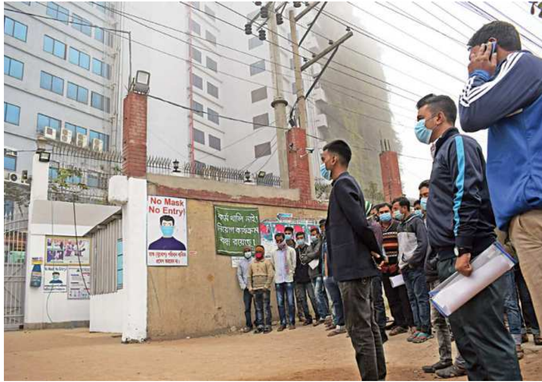
Laid off in the pandemic-induced economic downturn, garment workers wait patiently outside a factory in Ulail, Savar yesterday in hopes of work, refusing to be put off by a sign that reads "No Vacancies! Appointment Activities Suspended!"

The outcome of the study was presented during the dialogue on "Vulnerability, Resilience and Recovery in the RMG Sector in view of Covid-19 Pandemic: Findings from the Enterprise Survey".