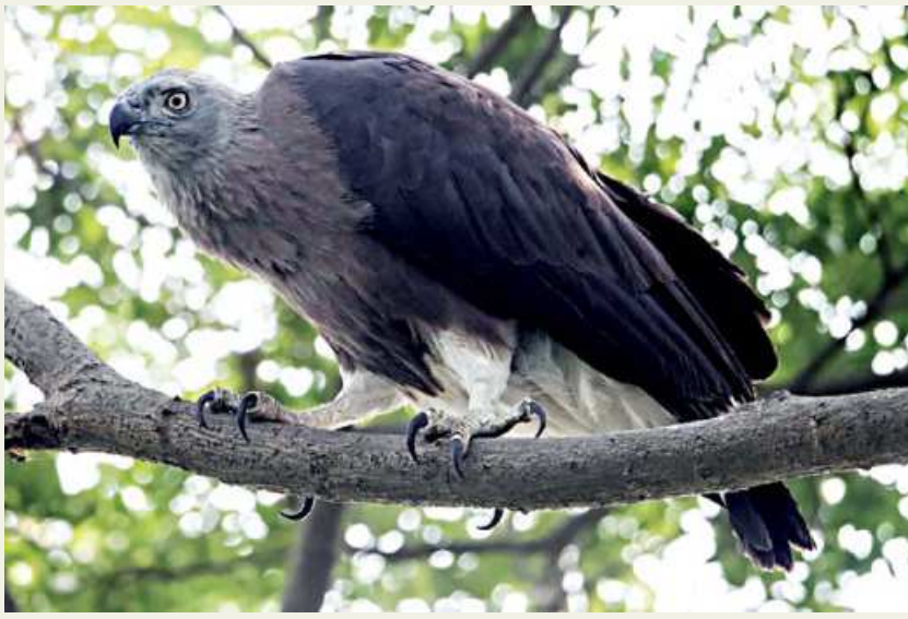
Grey-headed Fish Eagle, Muhuri, Feni.