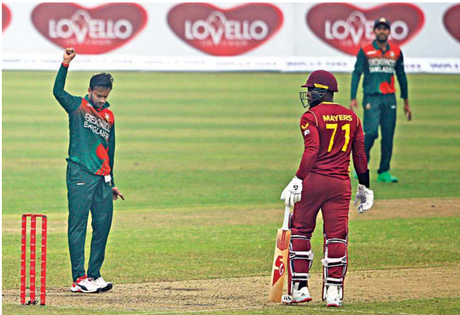
SIGHT FOR SORE EYES... Bangladesh's star all-rounder Shakib Al Hasan celebrates one of his four wickets during the first ODI against the West Indies at the Sher-e-Bangla National Stadium in Mirpur yesterday. It was Bangladesh's first international match in more than 10 months, and Shakib too was returning in Bangladeshi colours after serving out a one-year ban imposed by the ICC.