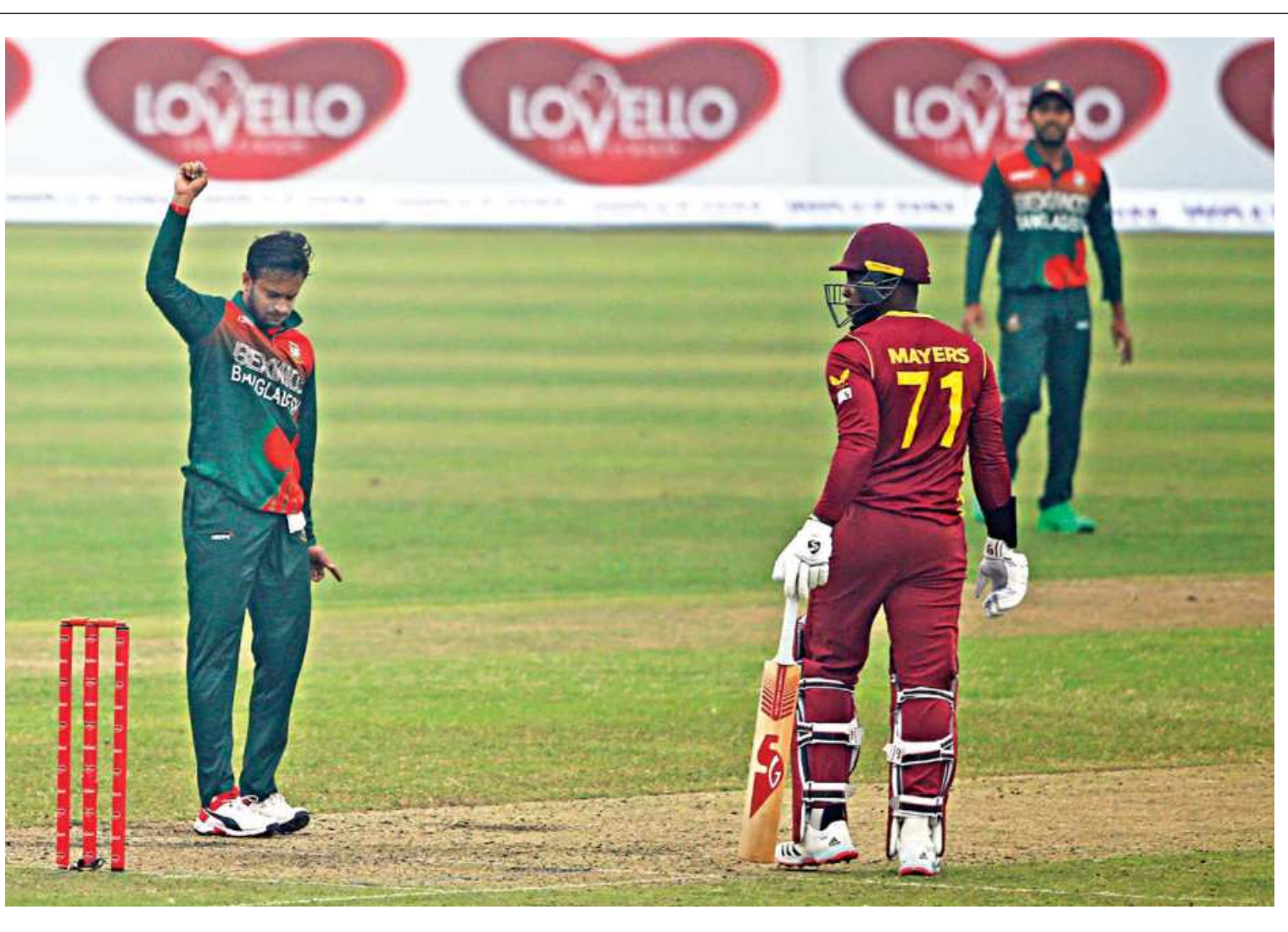
SIGHT FOR SORE EYES... Bangladesh's star all-rounder Shakib Al Hasan celebrates one of his four wickets during the first ODI against the West Indies at the Sher-e-Bangla National Stadium in Mirpur yesterday. It was Bangladesh's first international match in more than 10 months, and Shakib too was returning in Bangladeshi colours after serving out a one-year ban imposed by the ICC.