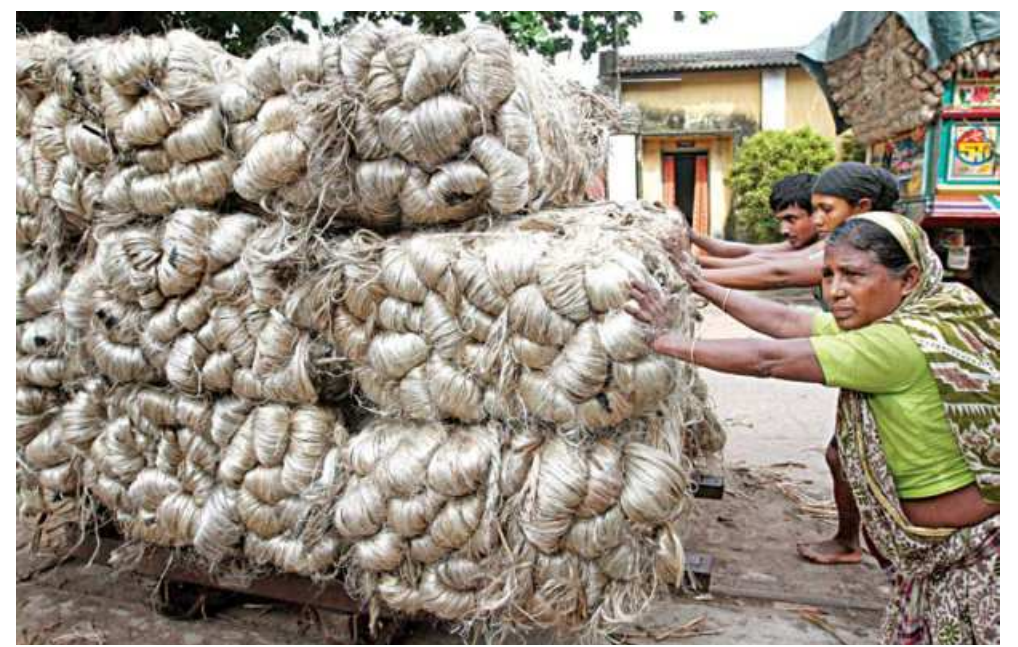
The government has set the restrictions to ensure smooth supply of raw jute in the local market and speed up export.