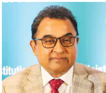
AHM Mustafa Kamal

packages has been helpful in bringing dynamism in business activities, protect and create jobs as well as create domestic demand, he said.