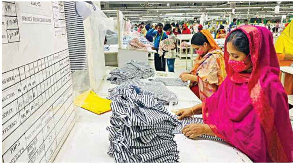
Obtaining the GSP Plus status is important for Bangladesh since the EU is the country's largest export destination for garments and other products.

The observations came at a virtual dialogue on the prospects of the EU's GSP Plus benefit for Bangladesh, jointly organised by the CPD and Network Matters, a research firm based in Brussels.