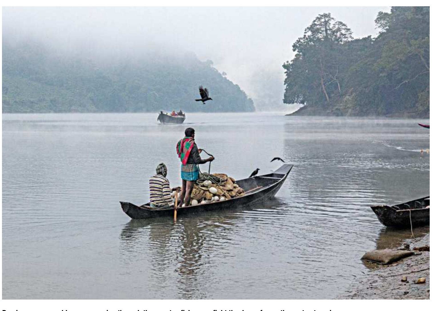
Braving a severe cold wave sweeping through the country, fishermen fight the dense fog as they set out on rivers. In order to make ends meet, it is not possible for them to remain cooped up in their homes. The photo was taken at Chattogram's Kaptai river recently.

PRAYER TIMING JANUARY 19 AZAN 5-30 12-45 4-15 5-40 7-00 JAMAAT 6-05 1-15 4-30 5-44 7-30 SOURCE- ISLAMIC FOUNDATION