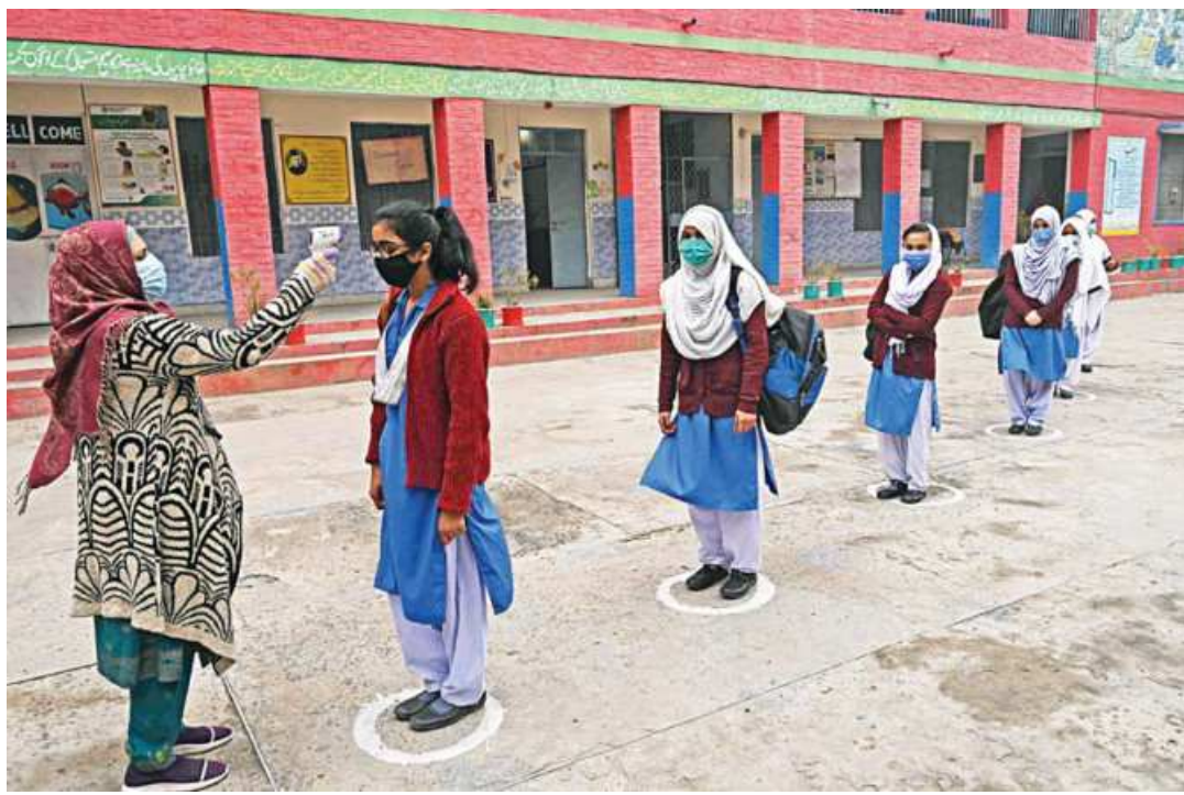
A teacher (L) checks the body temperature of students wearing facemasks upon their arrival at a school in Lahore yesterday, as the Pakistan government reopened educational institutes from grade 9th to 12th after remaining closed as a preventive measure against the coronavirus.

CNN previously reported there has been a crush of pardon requests during Trump's final days in office from allies, lobbyists and others hoping to cash in on their loyalty to Trump. The New York Times reported Sunday some of those people were getting paid tens of thousands of dollars to lobby on behalf of felons hoping for pardons.