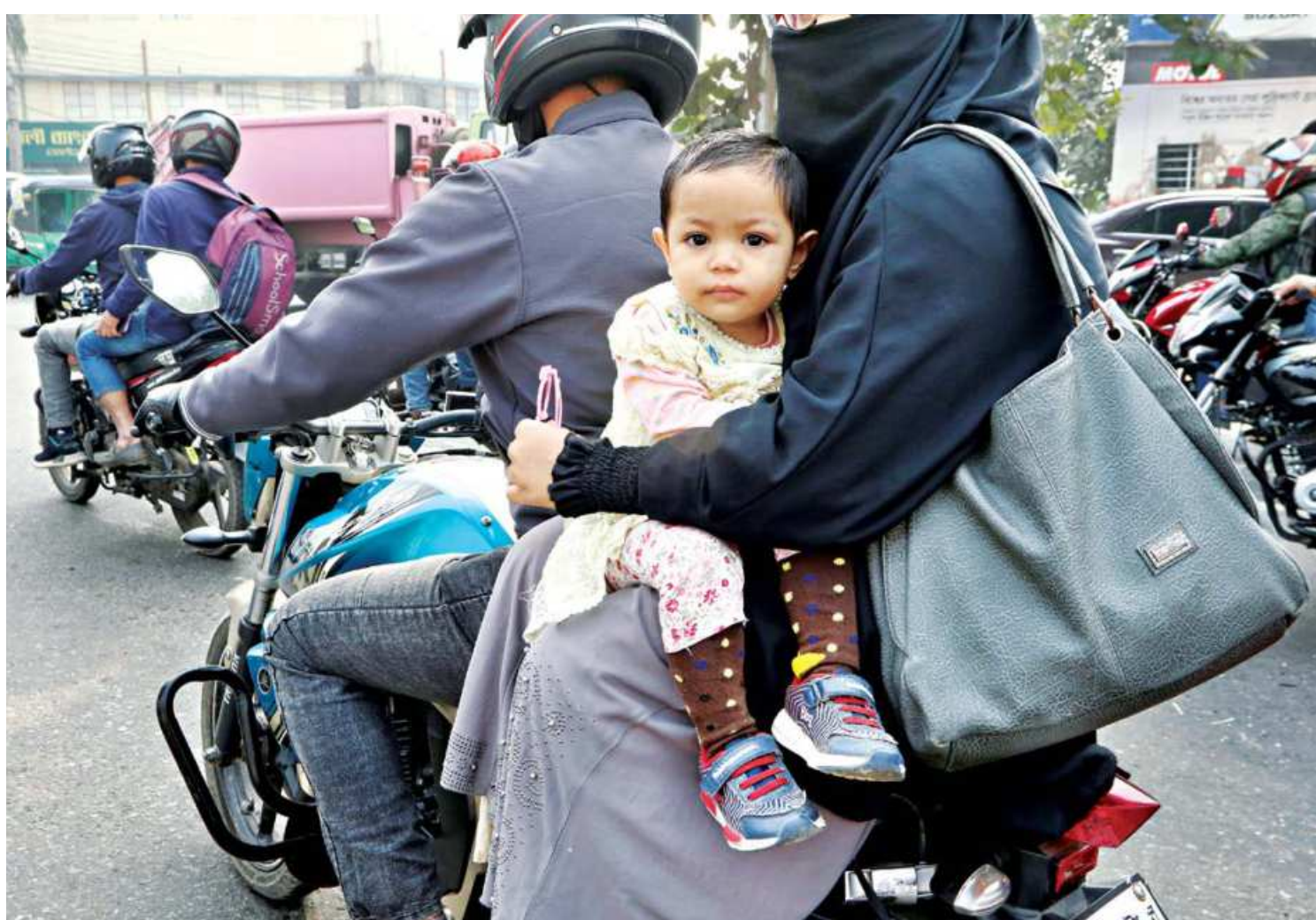
Flirting with Danger... Taking a child on her lap and without wearing a helmet, a woman rides a motorcycle in the capital's Tejgaon area yesterday. Accidents involving motorcycles are quite common in the city. Yesterday morning, a couple was killed as a bus hit their motorcycle from behind on Airport Road.