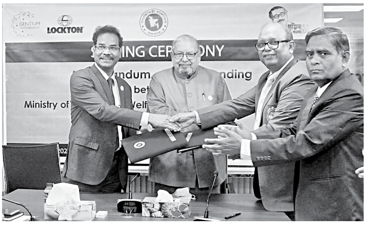
MINISTRY OF EXPATRIATES' WELFARE AND OVERSEAS EMPLOYMENT