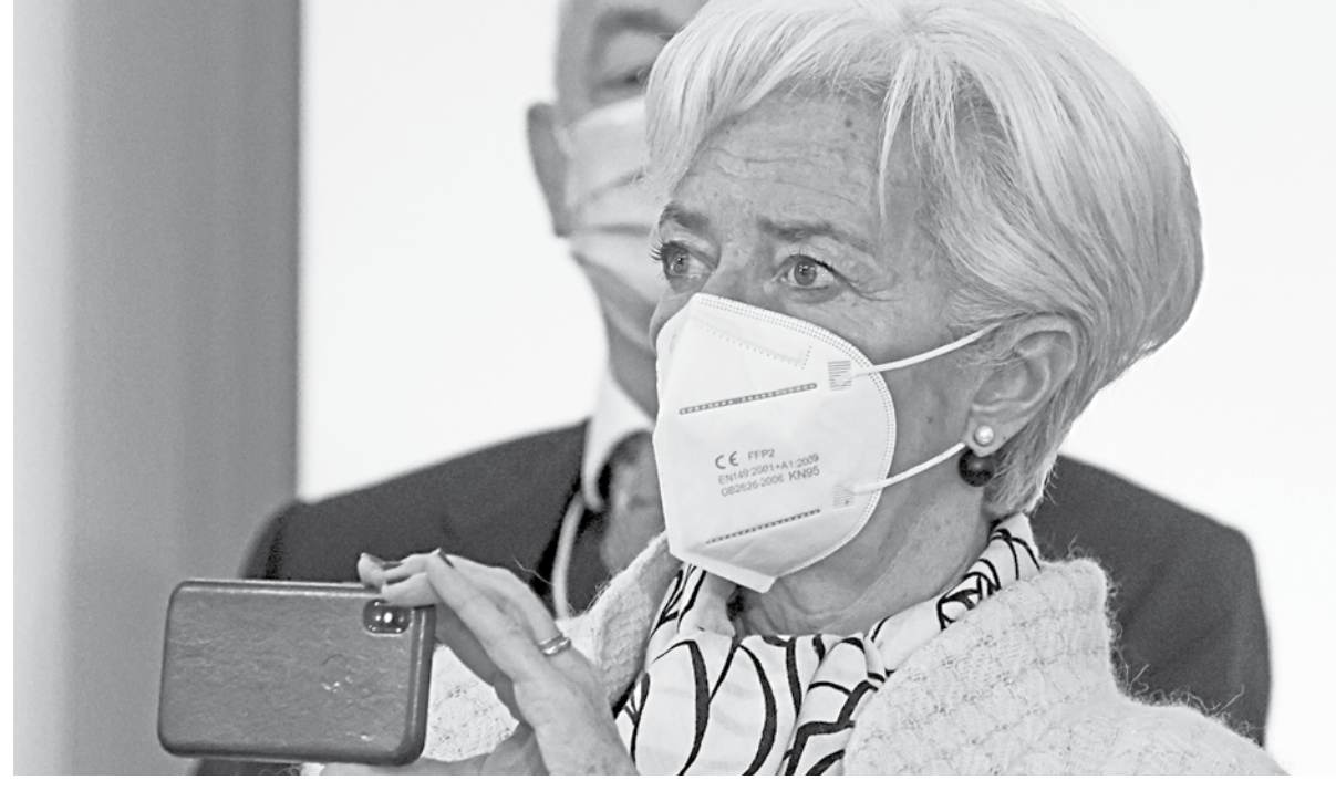
President of the European Central Bank Christine Lagarde holds her smartphone as she attends the One Planet Summit, part of World Nature Day, at the Reception Room of the Elysee Palace, in Paris.

The finance ministry is expected to present details of its final 2020 budget on Tuesday.