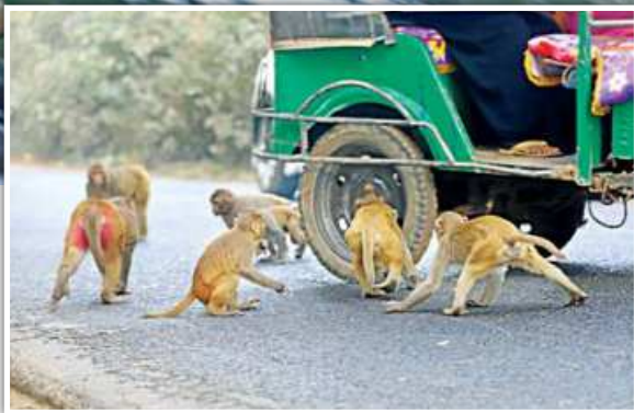
Facing food scarcity in Tangail's Madhupur forest, monkeys sometimes come out on the roads and go to people waiting in stationary cars in search of food. This increases risks of road accidents in the area. The photo was taken recently.