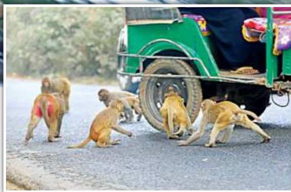
Facing food scarcity in Tangail's Madhupur forest, monkeys sometimes come out on the roads and go to people waiting in stationary cars, in search of food. This increases risks of road accidents in the area. The photo was taken recently.