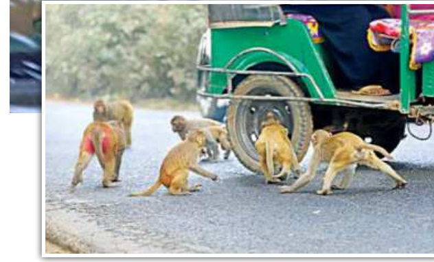
Facing food scarcity in Tangail's Madhupur forest, monkeys sometimes come out on the roads and go to people waiting in stationary cars in search of food. This increases risks of road accidents in the area. The photo was taken recently.