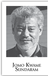
JOMO KWAME SUNDARAM