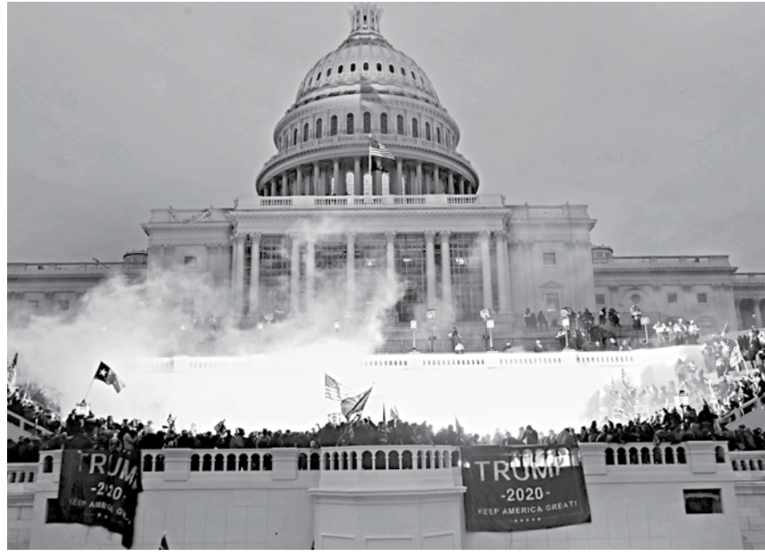
What one witnessed on January 6 was a third world script being played out on a first world stage by first world actors.

What is surprising for an outsider is that a country like the US, that boasts of its intellectual achievements and educational excellence should countenance a Goebbels-like propaganda of "stolen election", day in and day out, touted by its president, and believed too by a large number of Americans. Trump has destroyed democracy. By constantly questioning the election results and the election