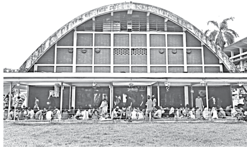
Teacher-Student Centre became the socio-cultural-politico of not only the University of Dhaka but the country six decades ago.