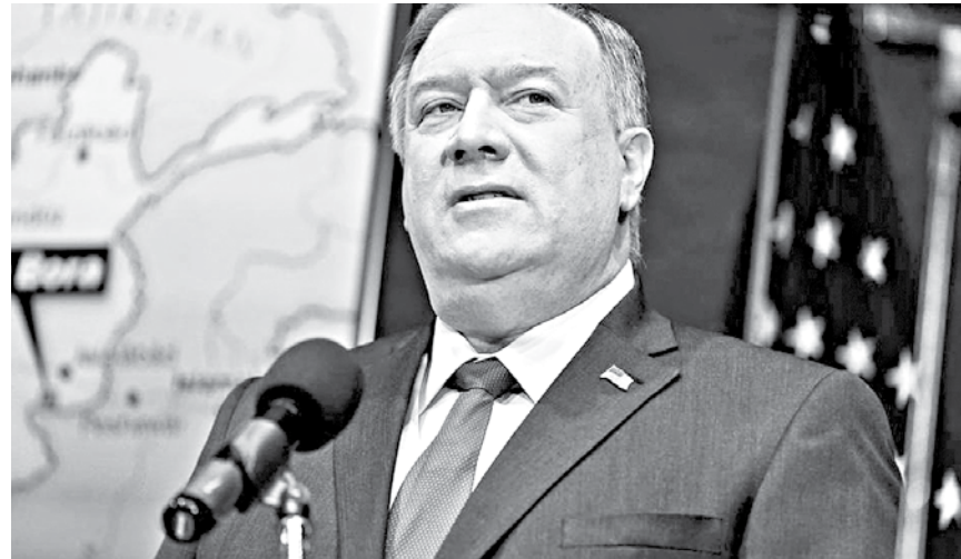
US Secretary of State Mike Pompeo alleges an Iranian alliance with Al-Qaeda in a speech at the National Press Club.

How much of this pressure the Biden administration will be able to handle, only time will tell.