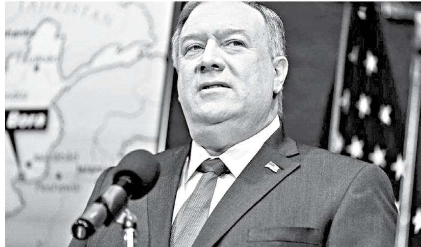
US Secretary of State Mike Pompeo alleges an Iranian alliance with Al-Qaeda in a speech at the National Press Club.

How much of this pressure the Biden administration will be able to handle, only time will tell.