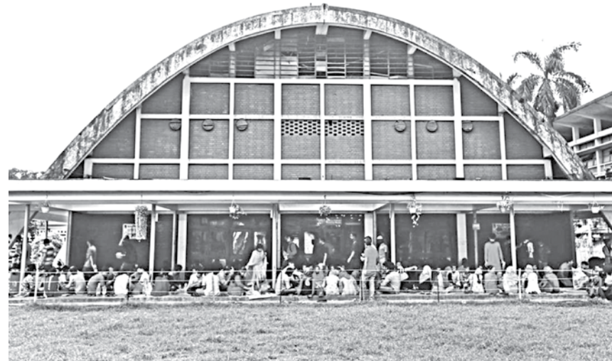
Teacher-Student Centre became the socio-cultural-politico of not only the University of Dhaka but the country six decades ago.