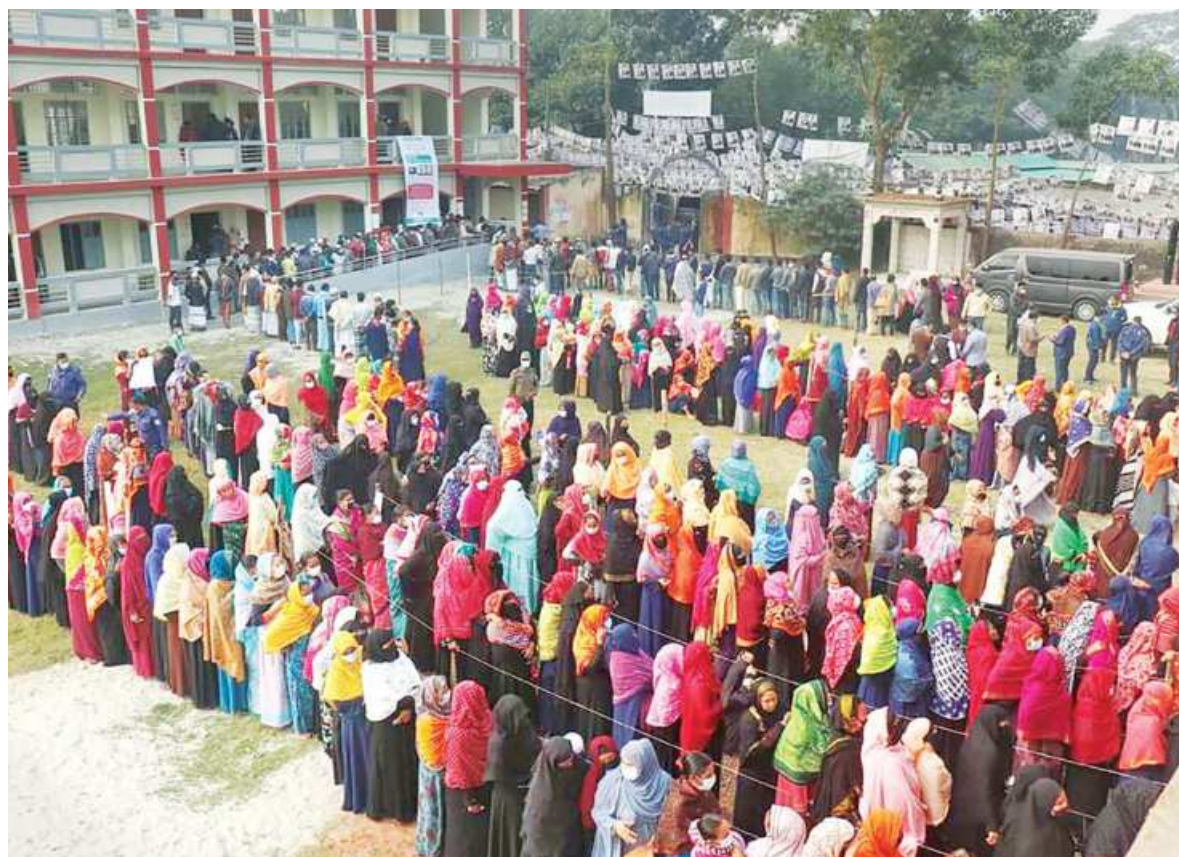
Long queues of people waiting to cast their vote in the municipality election at Harang High School Chandina, Cumilla. Many said they found interest in going out to vote because electronic voting machines were being used there.