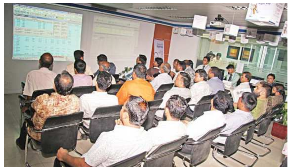
Investors watch price fluctuations of stocks on a large screen at a brokerage house in Dhaka.