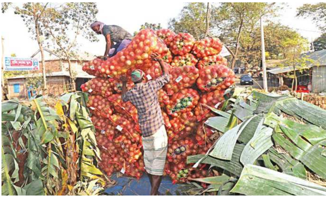
Vegetables such as brinjal are being loaded into vehicles in Birganj upazila of Dinajpur to be sent to other districts. The photos were taken yesterday.

The vegetables are consumed locally and supplied to other parts of the country as well.