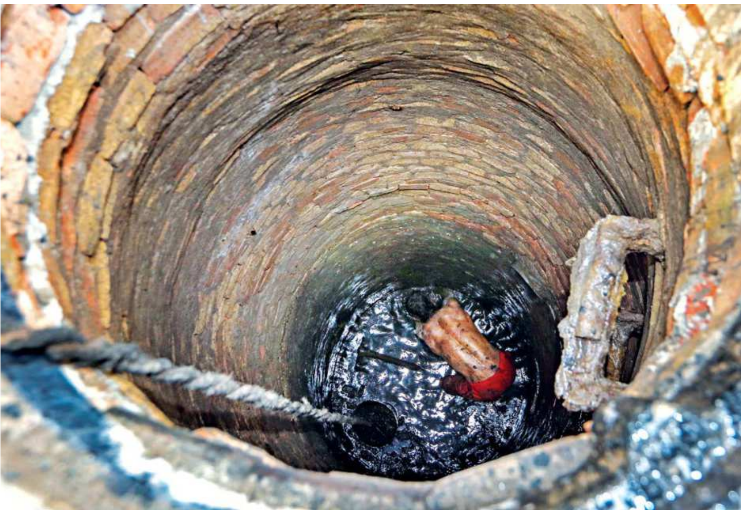
A worker of Dhaka Water Supply and Sewerage Authority (Wasa) cleaning a sewerage line in the capital to ensure uninterrupted drainage facilities to the city dwellers. He has no safety gears when even the inhalation of the fumes inside such manholes could become fatal. The photo was taken on the Holy Cross Road recently.