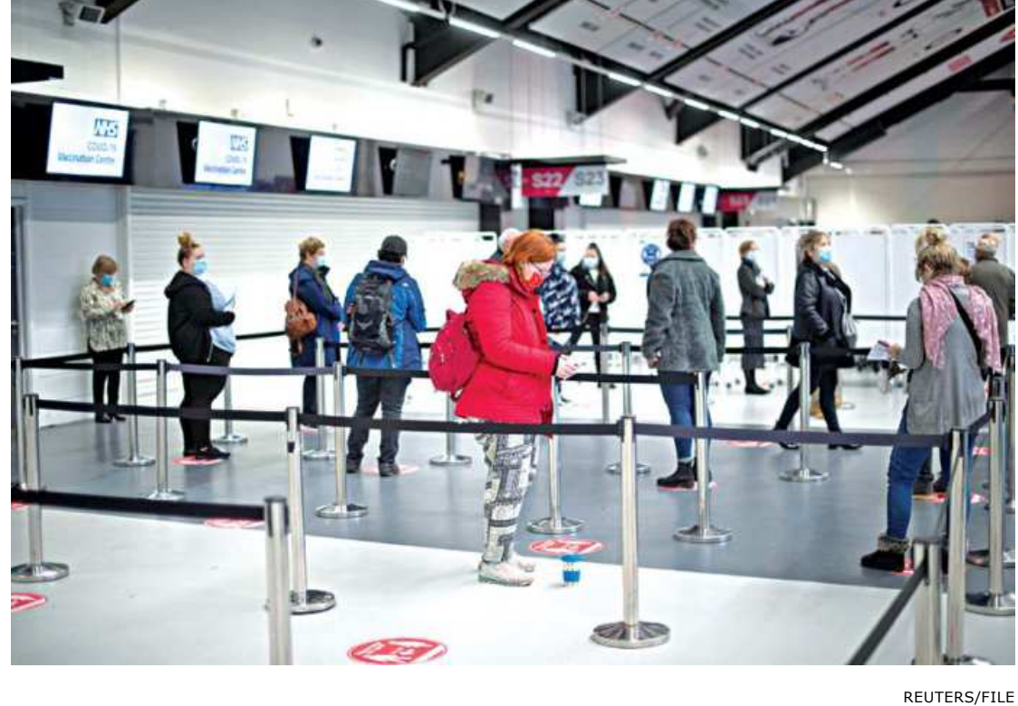
People wait in line for vaccination at Ashton Stadium in Bristol, Britain on January 11.

India's Foreign Subrahmanyam Jaishankar said the pandemic had created an "accidental challenge" under which the government delivered food on a regular basis to 800 million people and provided sustained business funds.