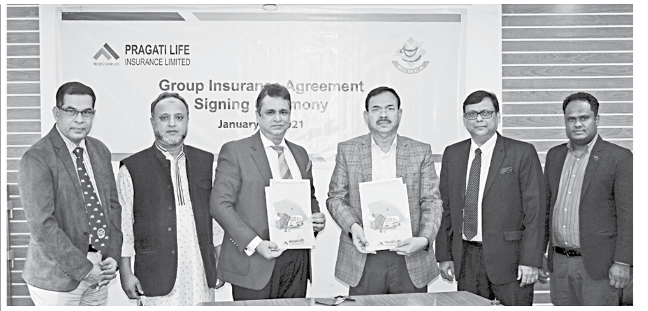
PRAGATI LIFE INSURANCE