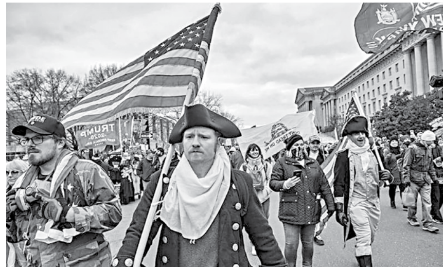
Supporters of US President Donald Trump march through the streets of the city as they make their way to the Capitol Building in Washington, on January 6, 2021.