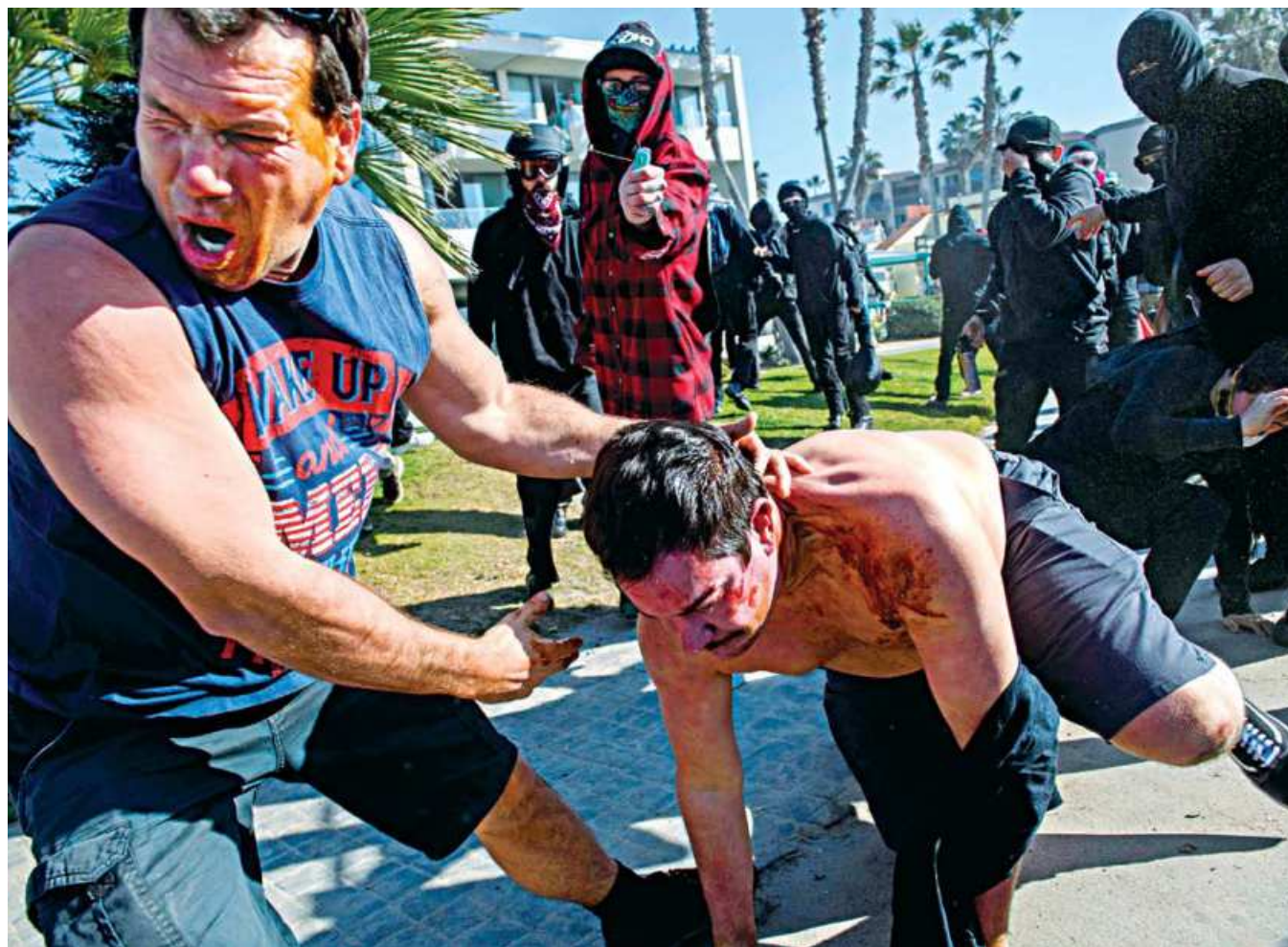
Counter-protesters spray pepper spray as they clash with people during a "Patriot March" demonstration in support of President Trump on January 9, 2021 in the Pacific Beach neighborhood of San Diego, California. As most Americans recoiled in horror at scenes of rioting and chaos in the US Capitol on Wednesday, which killed 5 people, some right-wing and anti-government extremists saw the violence as the fulfillment of a patriotic duty or opportunity to advance their agenda. The mob's strike at the symbolic heart of the US government suggests that Trump's baseless claims of election fraud may have unified a broader coalition of extremists who could pose a threat again when Biden takes office on Jan 20 and into his four-year term in office, experts said.