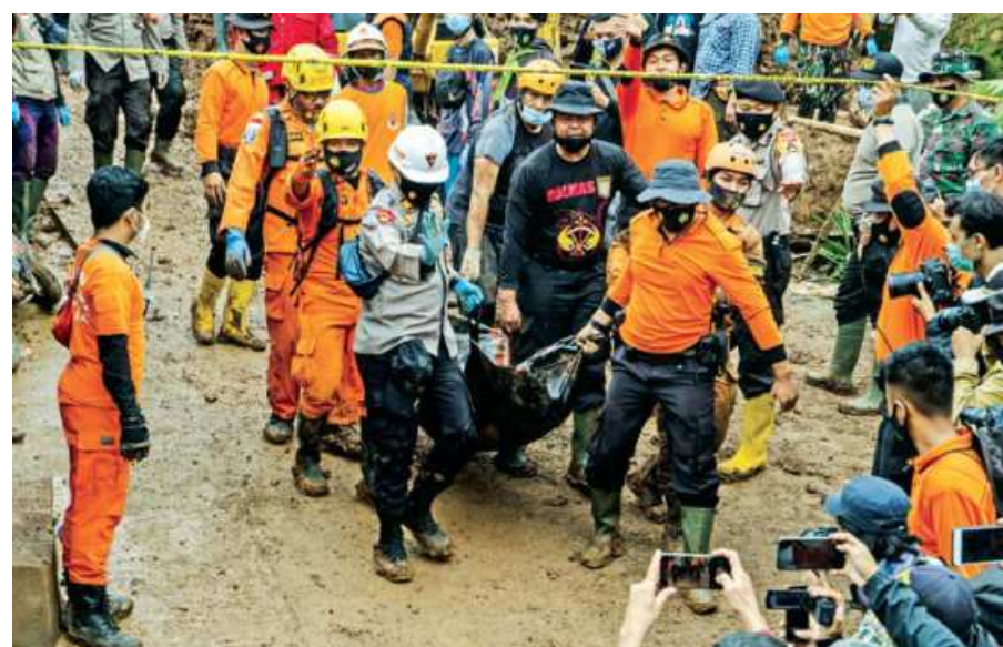
Indonesian rescuers carry a body bag during the search for victims buried by landslides in Samedang, West Java Province, Indonesia, yesterday. At least 11 people were killed and scores more were missing after torrential rains hit the region Saturday evening.

"We need to stop the wildlife trade for human consumption."