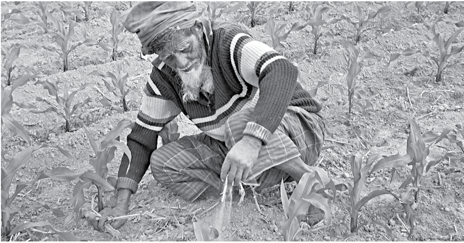
Braving extreme cold temperatures, an elderly farm worker clears weeds in a crop field in Lalmonirhat.