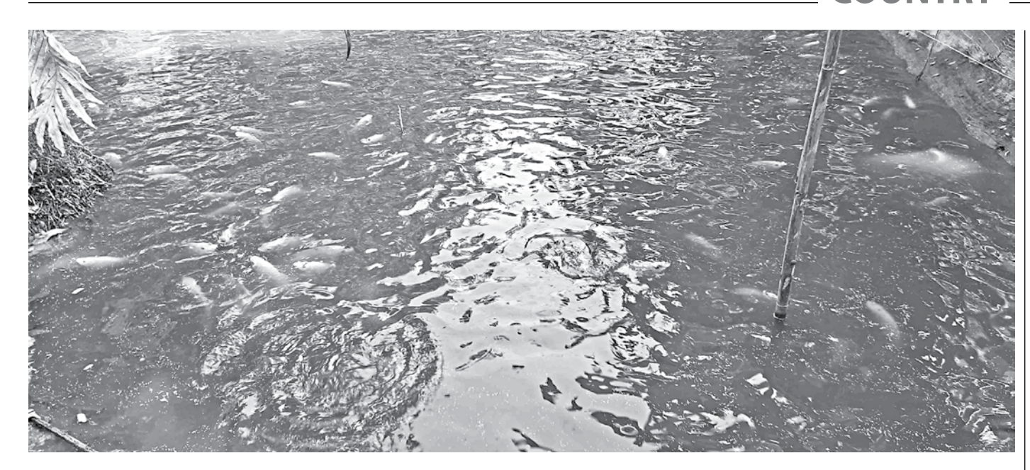
A school of colourful tilapia, commercially produced at a fish farm, in Sundarghona-Kanthaltala village of Bagerhat Sadar upazila.