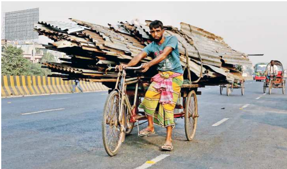
A rickshaw-van is loaded with rusty corrugated iron sheets in such a way that its puller is not even peddling the vehicle to the destination yesterday. The photo was taken on Dhaka-Chattogram highway near Jatrabari where plying of such non-motorised vehicles is illegal.

Meanwhile in Narayanganj, at least 20 readymade garment workers were injured in a clash with police in Shiddhirganj upazila. The clash took place when the workers were staging demonstration demanding their due wages in front of the main gate of Adamzi EPZ around 1:00pm. Police and witnesses said workers of Kwun Tong Apparels Ltd started demonstration at around 8:00am demanding due wages. Later, around 1:00pm, the workers took position on Shimrail-Adamzi-Narayanganj road and halted vehicular movement. On information, police rushed to the spot and tried to drive away the workers. It triggered clash between the two groups. Police charged batons and lobbed tear shells to disperse the workers. At least 20 workers were injured in the incident, claimed workers. Contacted, Moshitur Rahman, officer-in-charge of Siddhirganj Police Station, said the demonstration caused long tailback on road. "That is why, police drove them away. Now the situation was under control," he added. Our Kushtia and Narayanganj correspondents contributed to this report.