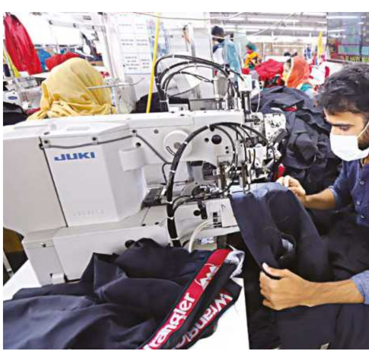
Honesty has played a vital role for Snowtex to achieve consistent growth in apparel business.