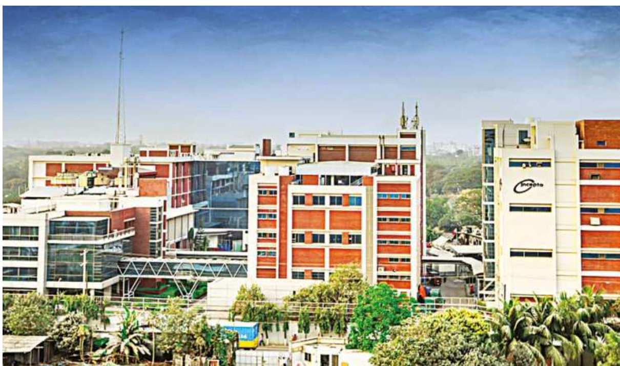
Incepta has established well-designed factory to manufacture products of global standards.