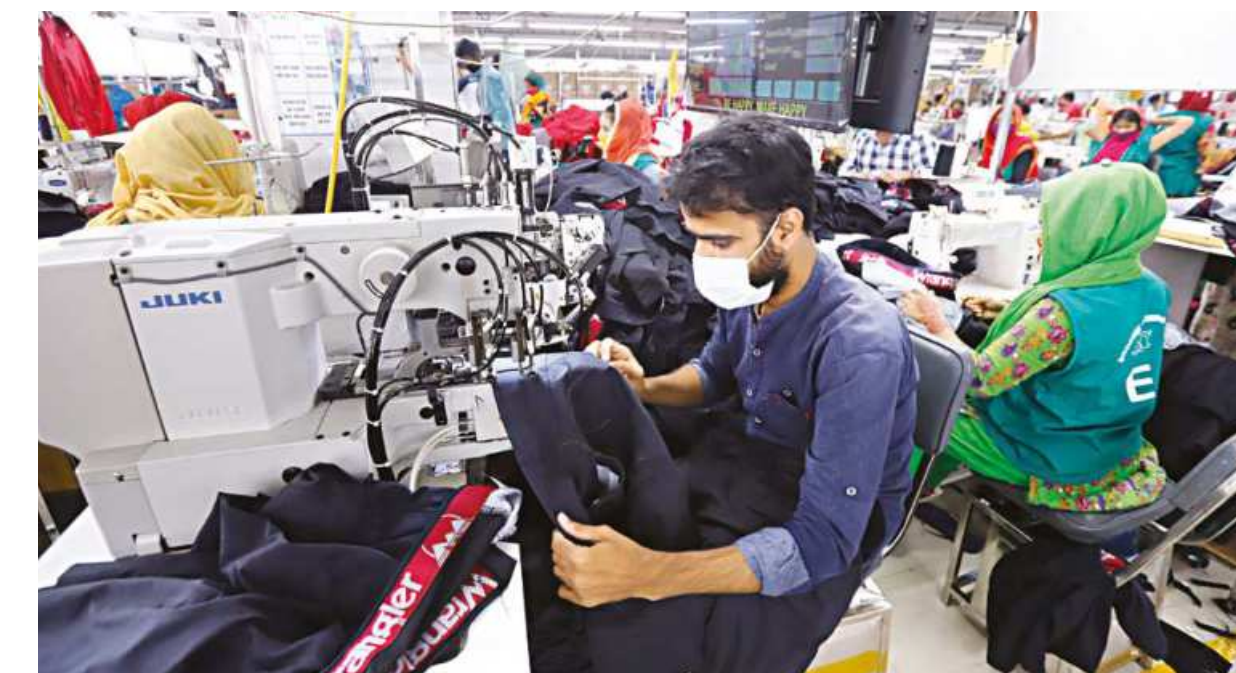
Honesty has played a vital role for Snowtex to achieve consistent growth in apparel business.