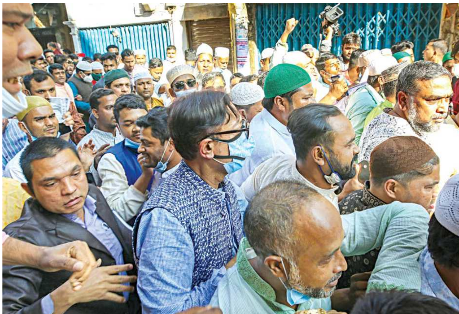
People campaigning for the Chattogram City Corporation elections, slated for January 27, while ignoring safety guidelines amid the coronavirus pandemic. Not only are they crowding together, many are not wearing masks or wearing them improperly. This photo was taken from the port city's Jail Road yesterday.