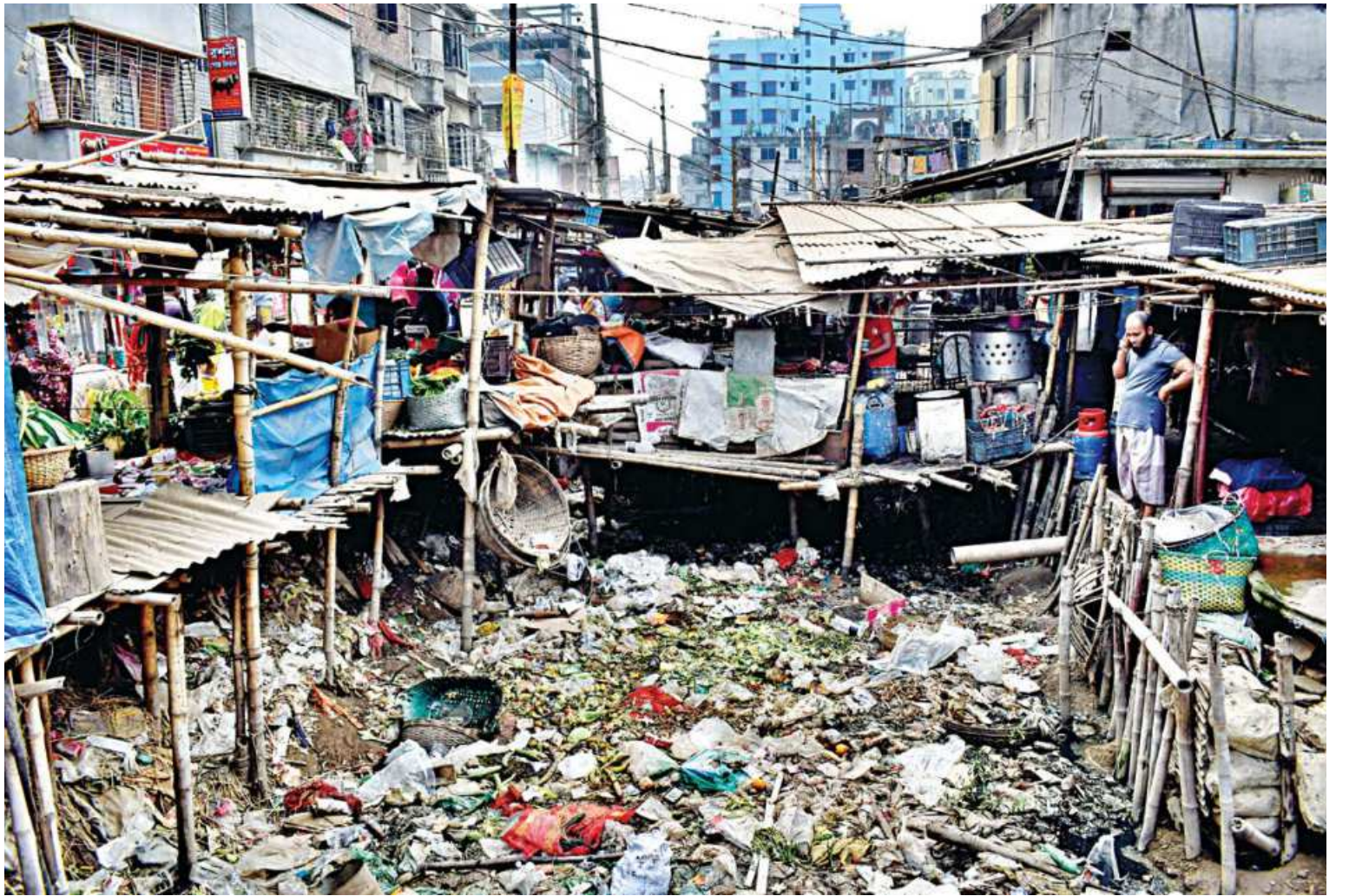
The surface of this canal, surrounded by makeshift shops, in Deb Dholaikhal is completely obscured by garbage, polythene and weeds. Not only is the canal's current state an environmental hazard, its stagnant water has also become a breeding ground for mosquitoes, which is a health risk and nuisance for people living nearby. The photo was taken from Kajlarpar area in the capital's Jatrabari yesterday.