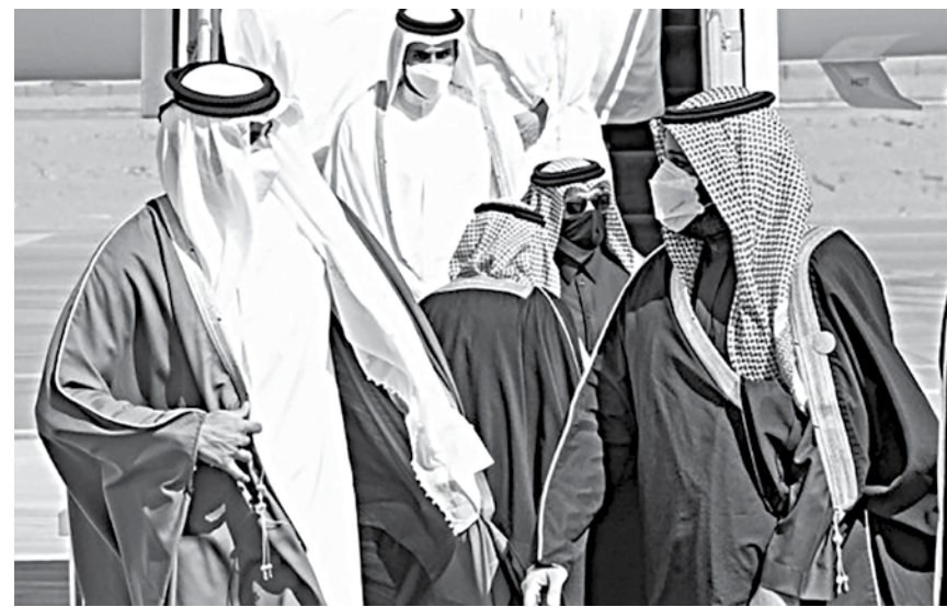
Saudi Crown Prince Mohammed bin Salman welcomes Qatar's Emir Sheikh Tamim bin Hamad al-Thani in Al-Ula, Saudi Arabia, on January 5.

Tasneem Tayeb is a columnist for The Daily Star. Her Twitter handle is: @TayebTasneem