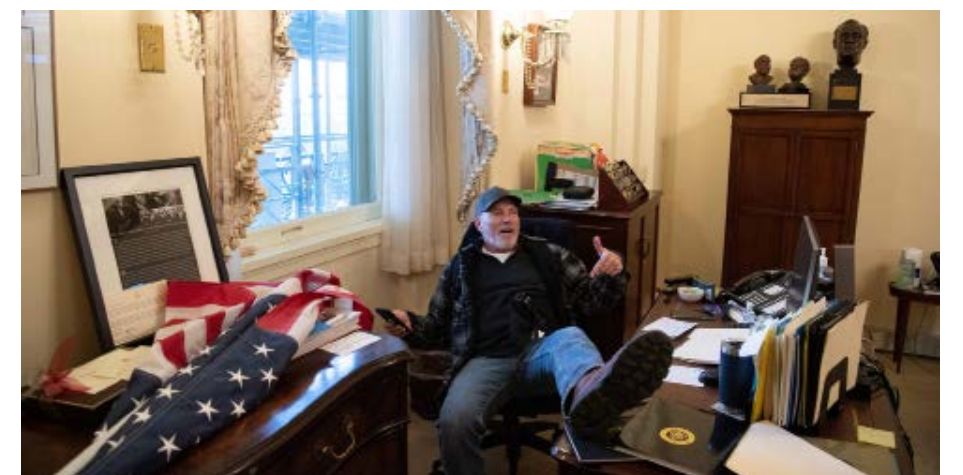
A Trump supporter sits in the office of House Speaker Nancy Pelosi, who was forced to evacuate, in what was NOT a coup.